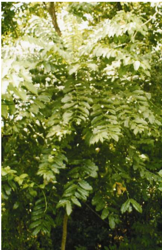
Figure 1 Zanthoxylum tsihanimposa in Ankarafantsika forest