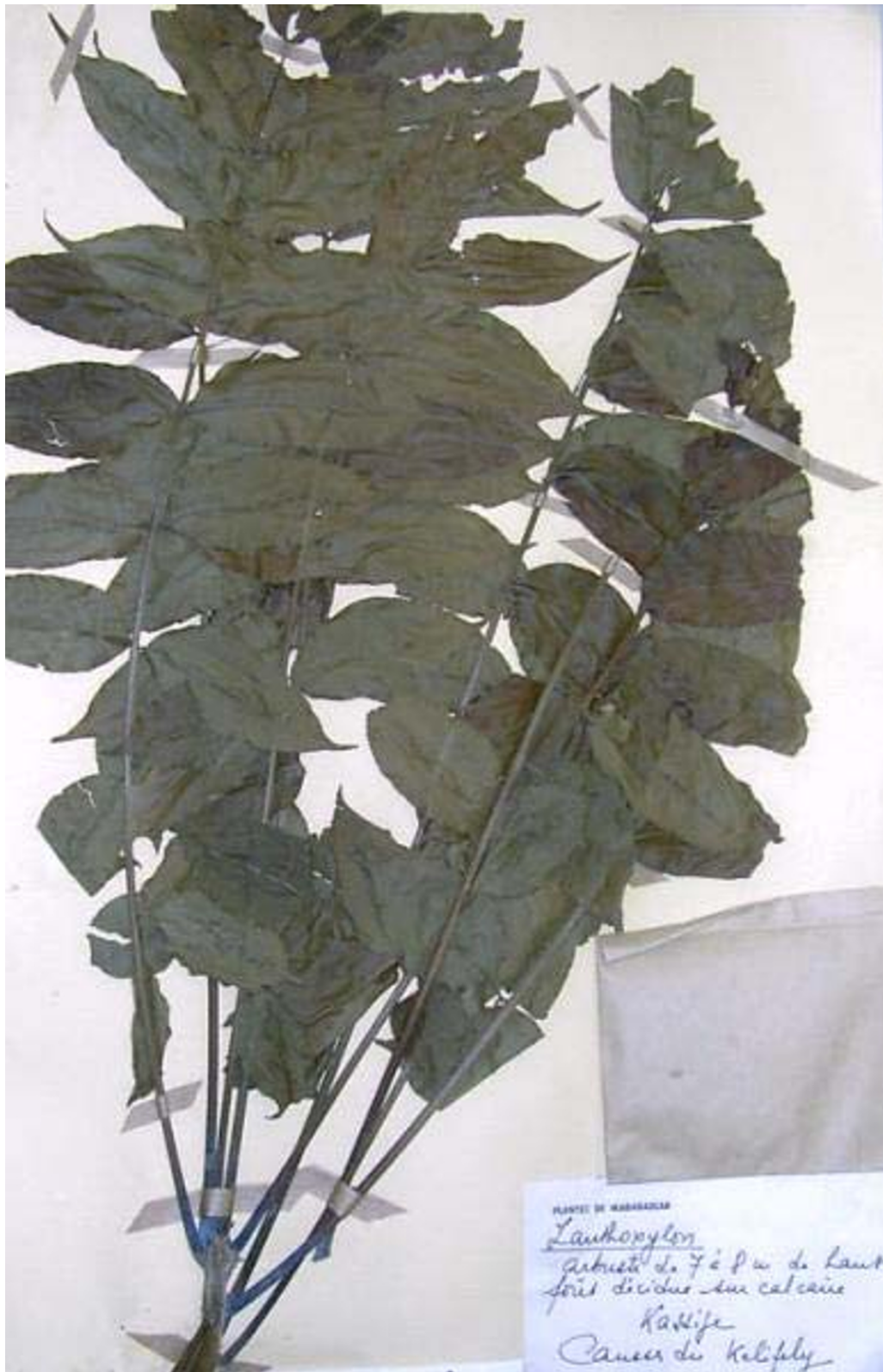
Figure 3 Authentic voucher specimen of Zanthoxylum tshanimpasa leaves, kept at the Botany Department of the National Park, which used for plant identification