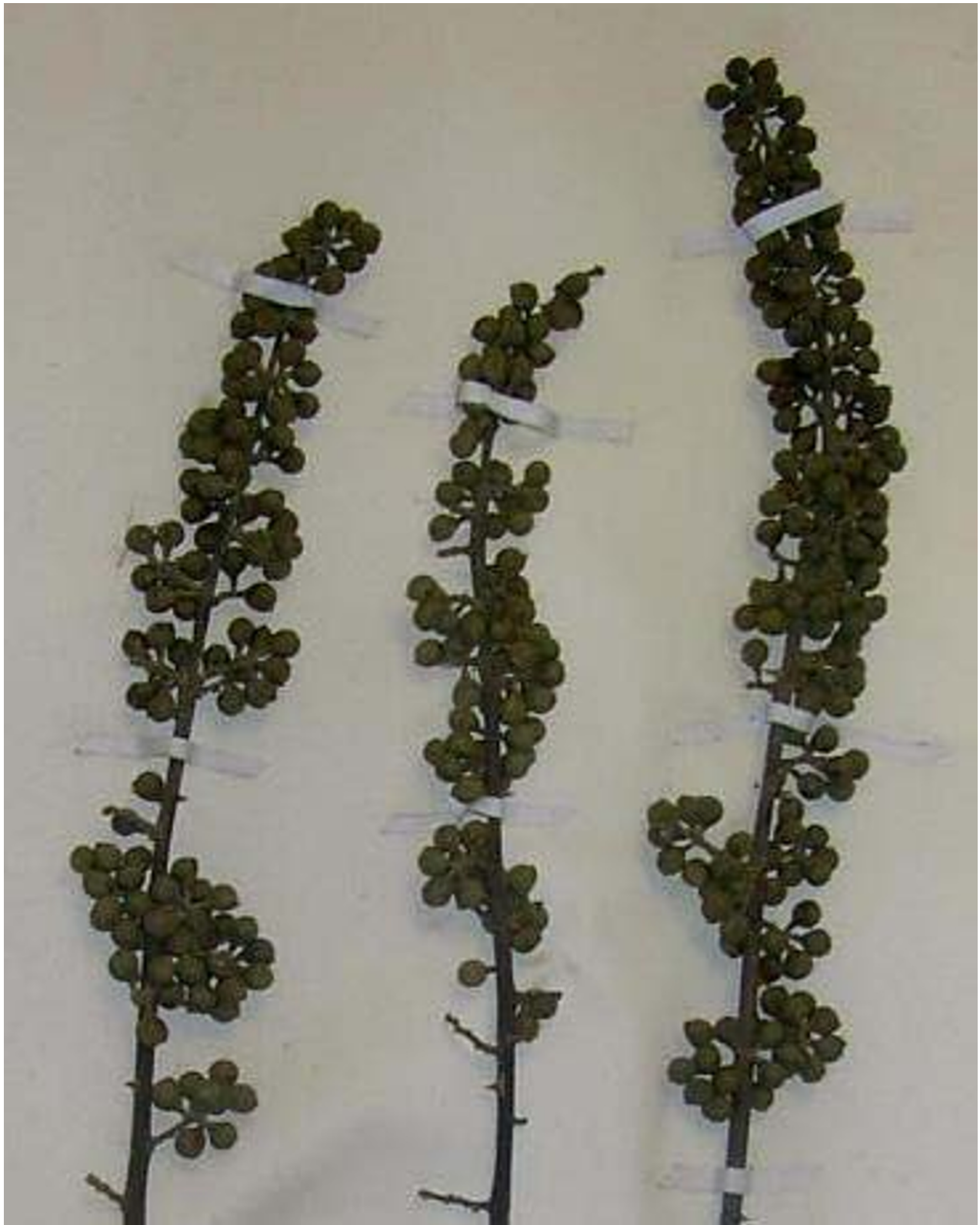
Figure 2 Authentic voucher specimen of Zanthoxylum tsihanimposa fruits, kept at the Botany Department of the National Park, which we used for plant sample identification