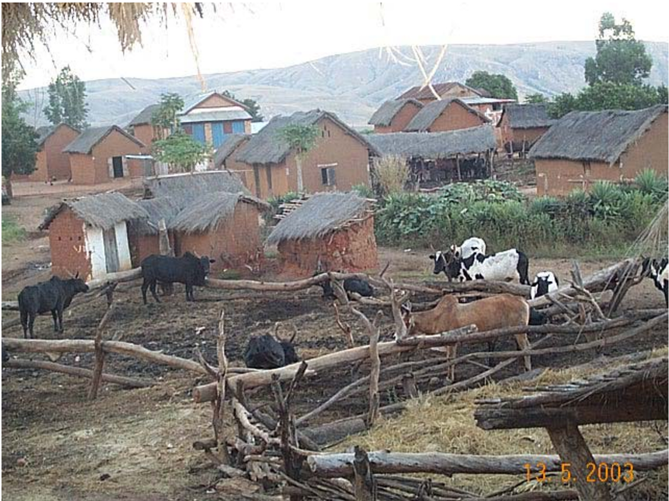
Figure 2 View of the village of Analamiranga. Zebus are kept in the village during the night in these highlands of Madagascar.

The results are from December 2002 to May 2003 in AMG (i.e. 12 nights with 192 men-nights for human landing collections and 36 traps-nights for Mbita trap collections) and December 2002 to March 2003 in SOA and ANH (i.e. 8 nights with 128 men-nights and 24 traps-nights in each of these 2 villages).