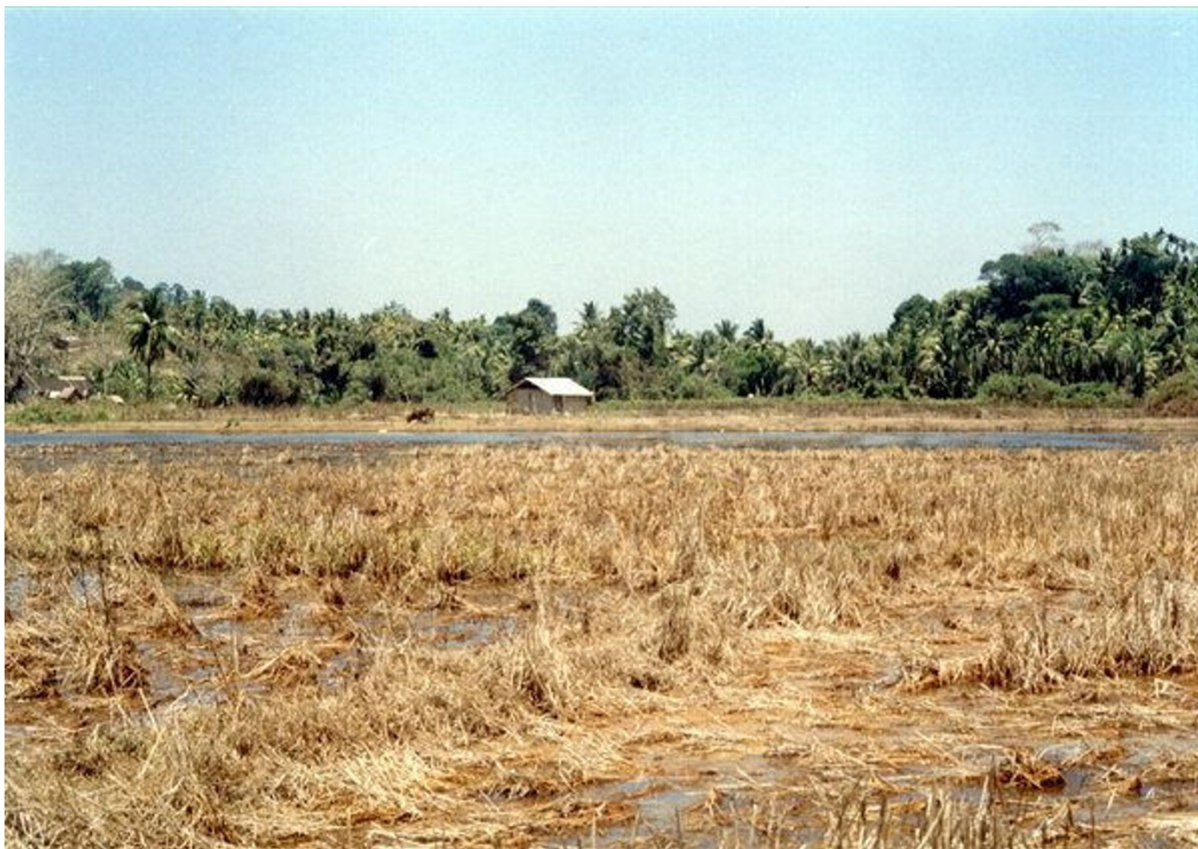
Figure 3 Photograph showing the paddy field flooded with seawater.

sites. In addition to its original breeding grounds of creeks and streams [13] in South Andaman, now its breeding has been extended to paddy fields and fallow lands flooded with seawater. Paddy fields and fallow lands with fresh water hitherto considered, as least potential sites for An. sundaicus are now a major breeding habitat due to saline water. Destroyed paddy fields are perhaps the first record of major breeding source for An. sundaicus .