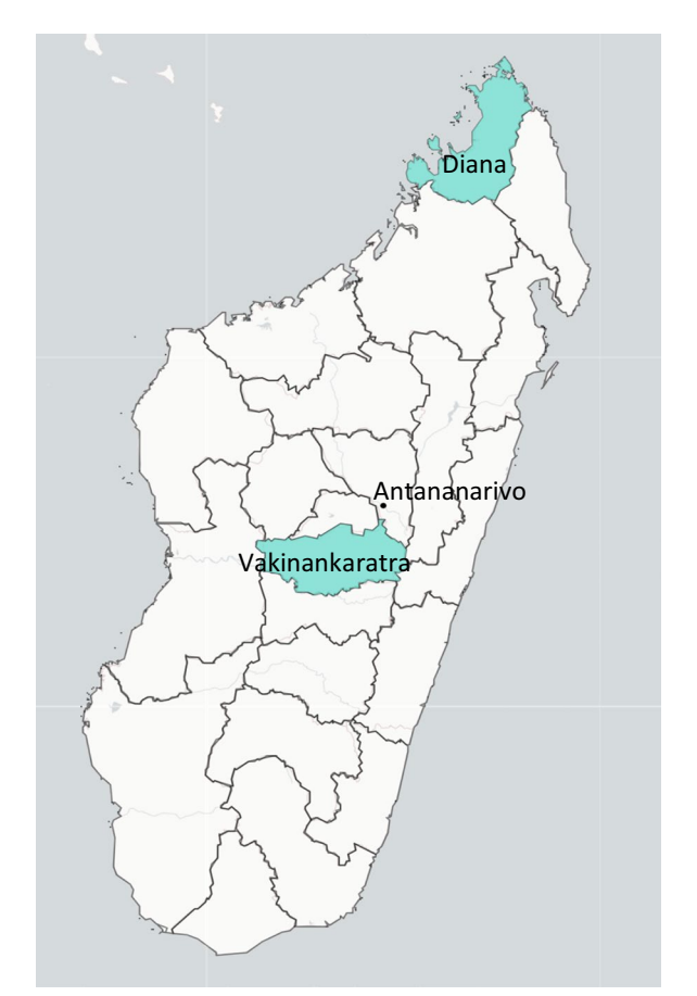
Fig. 1 Map of regions included in the project, Vakinankaratra Region (Antsirabe II and Faratsiho districts), Diana Region (Antsiranana I district)

Gebreegziabher et al. Malaria Journal (2024) 23:121